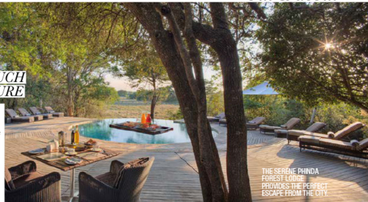
THE SERENE PHINDA FOREST LODGE PROVIDES THE PERFECT ESCAPE FROM THE CITY.

'Durban has some great spots. I mostly go to Saviour Coffee, Love Coffee and Lineage Coffee, where the brews are always excellent. Gets me set for the day!'