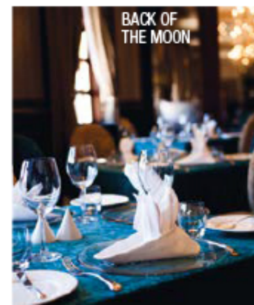
BACK OF THE MOON

'This is great for date night. Good soul food and live jazz bands.'