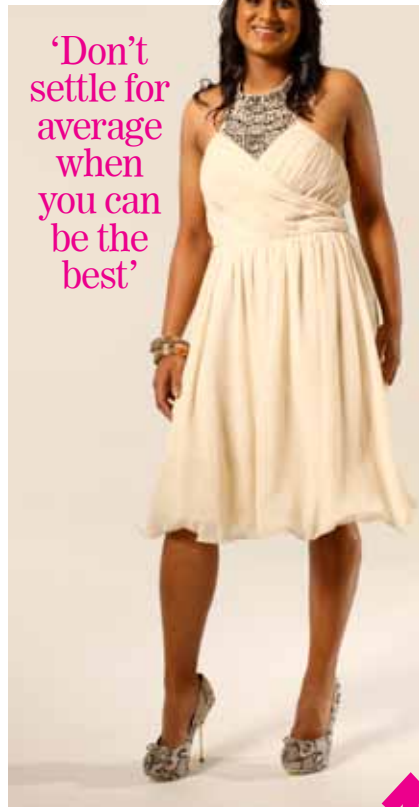
TRISHA CHETTY Cricketer

‘Don’t settle for average when you can be the best’